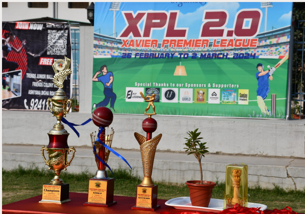
The winning trophy