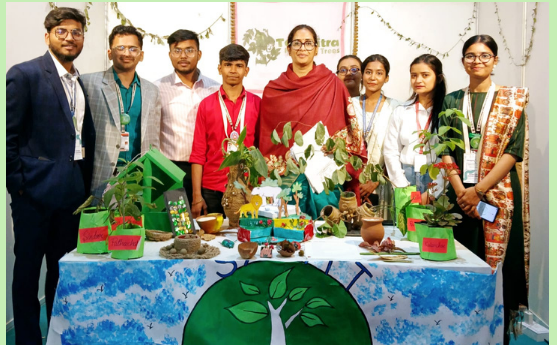
SXCMT Students with Principal Secretary, Ministry of Environment, Forest and Climate Change

On March 4, a remarkable event aimed at tackling climate change and promoting environmental conservation - the Bihar Climate Action Conclave was held at Gyaan Bhawan, Patna. With a commitment to address pressing environmental issues, eleven students of SXCMT participated in this conclave. The participants were welcomed with 'seed identity cards' and essential materials, setting the stage for a day filled with innovative solutions and meaningful discussion on sustainable development. The presence of dignitaries added to the event's significance. Chief Minister Nitish Kumar, Deputy CMs Samrat Chaudhary and Vijay Kumar Sinha, and Dr. Prem Kumar (MLA), graced the occasion with their presence, underscoring the government's commitment to environmental management.